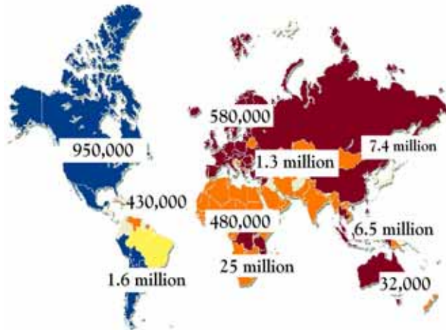
Estimates of HIV/AIDS infections worldwide